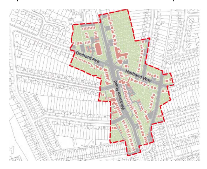
Extract from the Suburban Design Guide showing the site within the Shirley Intensifications Area